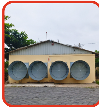
Cone Exhaust Fan